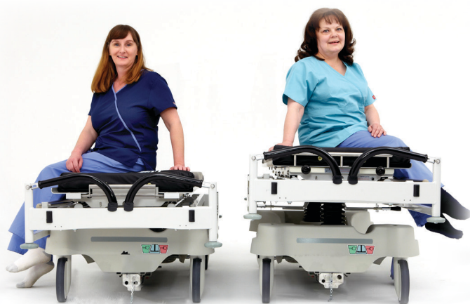
Low Profile Gurney (on left) compared to Standard Gurney (on right)